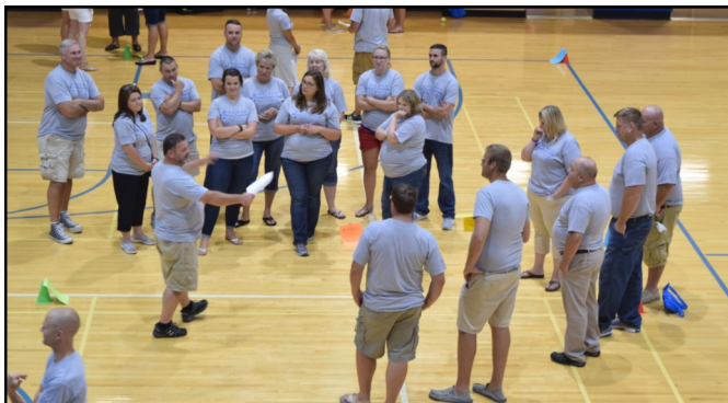
Cohort members participate in team building exercises during the evening activities.