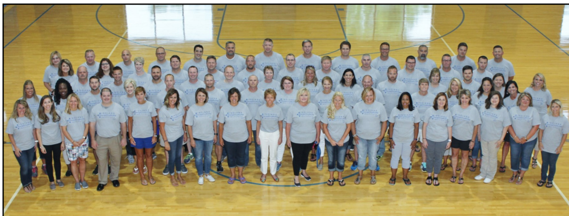
On July 11, the Indiana Principal Leadership Institute welcomed 59 Indiana principals and 11 mentors to Cohort 5.

During the 2017 Summer Seminar, IPLI recognized Congressman Jim Banks for his outstanding service and dedication to Indiana education. Congressman Banks (former Indiana Senator) was the author of SB 402, passed in 2013 creating IPLI.