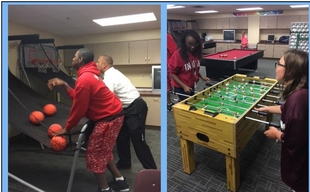
Students at Belzer Middle School enjoy the PBIS Rewards Room during lunch period.