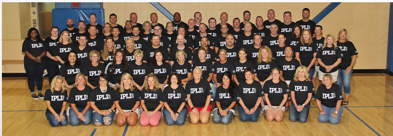
Graduating Cohort #7 from 2019 Summer Seminar.