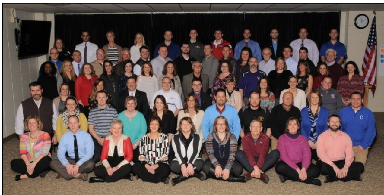
INALI Cohort #2 graduated 52 deans, assistant principals, and principals during the February seminar.