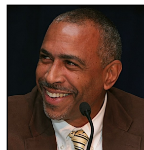
Dr. Pedro Noguera

Dr. Pedro Noguera: Pedro is a Distinguished Professor of Education in the Graduate School of Education and Information Sciences at UCLA, Director of the Center for the Study of School Transformation, and coauthor of Excellence Through Equity: Five Principles of Courageous Leadership to Guide Achievement for Every Student .