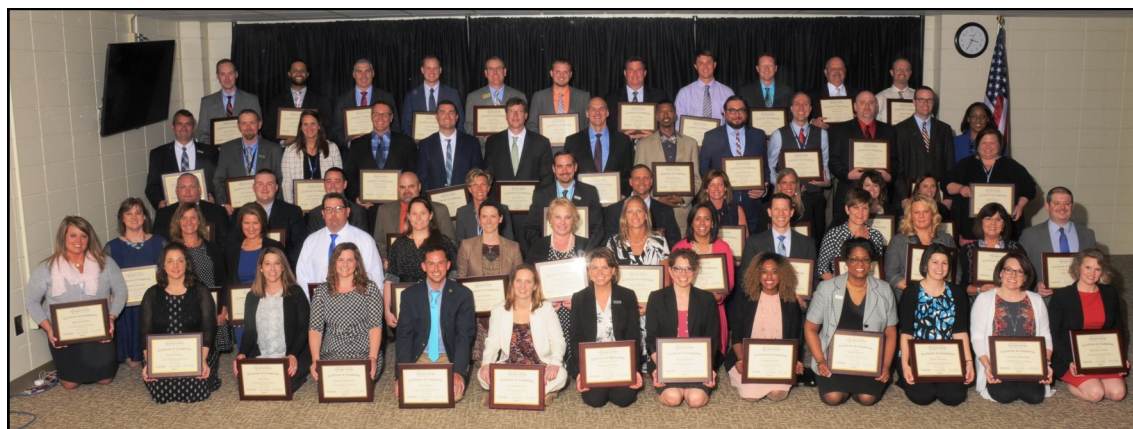
IPLI Cohort #3 graduated 53 principals at the April 10, 2017, celebration.

Over the next two months, IPLI will be preparing for the annual IPLI Summer Seminar to be held July 11-13, 2017, on the campus of Indiana State University. For an overview of the agenda for the three days, see page 6.