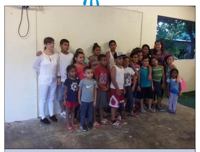
Milan High School collected donations to buy t-shirts for students impacted by the recent hurricanes in Puerto Rico. Pictured above is a class in Puerto Rice wearing their new t-shirts.