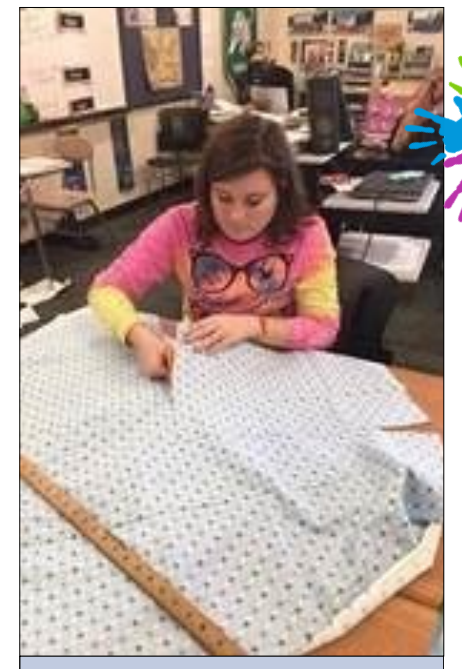
A Triton Central Middle School student making a blanket for a pediatric patient.