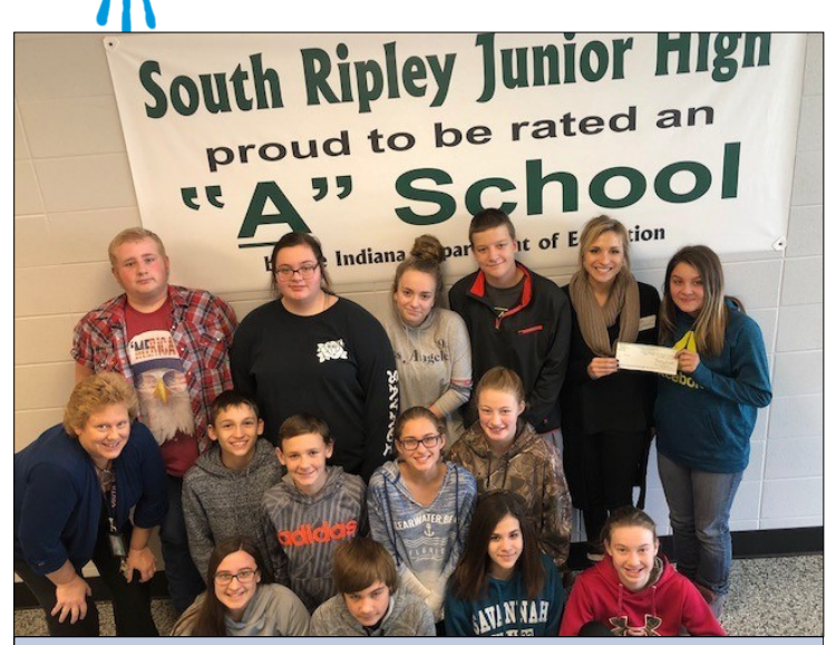
South Ripley Jr. High School students collected donations for Safe Passage an organization helping local victims of domestic violence and their families take important steps on their road to recovery.