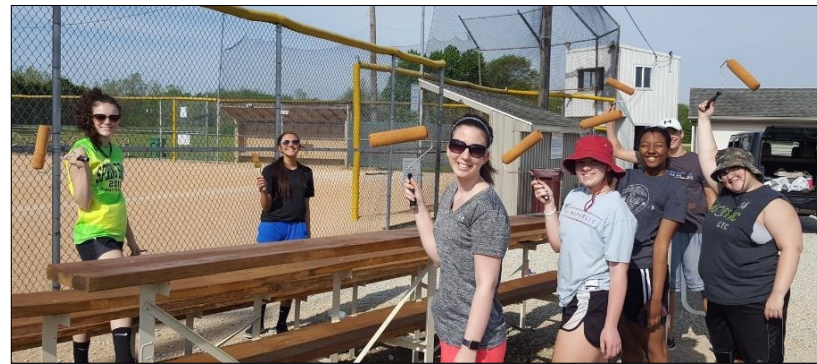
Western High School seniors participate in "Give Back to the Community Day."