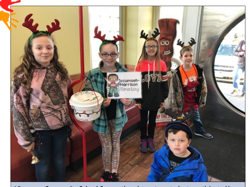
Vincennes Community School Corporation elementary students participated in the Kettle Decorating Competition to raise money for the Salvation Army.