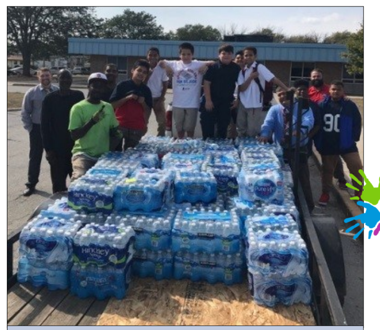
Students and staff of Charles N. Scott Middle School collected over 300 cases of water and $350 for the citizens of Calumet.