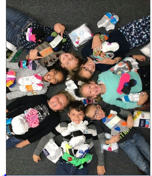
Stinesville Elementary students collected 810 pairs of socks for the needy.