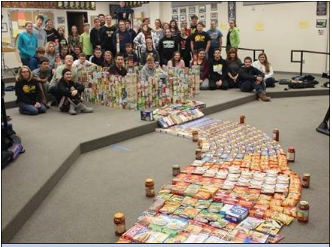
Milan band members collected 1428 food items to help local families during the holidays.