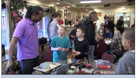
Fifth graders at @DRESVoyagers visit veterans at Fort Wayne's Shepherd's House.