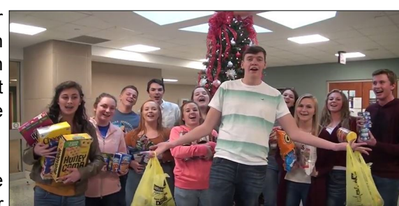
Rushville Consolidated High School created the 12 Days of Caring project for their food drive. http://bit.ly/2Bp6HXd. For more information on great service projects by IPLI participants' schools, see pages 8-12.

In this issue of the IPLI Newsletter, we take some time to reflect back on our November and January seminars and the graduation of INALI Cohort 3 earlier this month. We've also used this edition to highlight some of the great service learning projects being completed last year by our participants' schools (see pages 8-12).