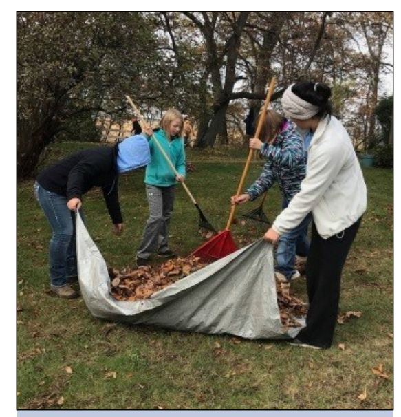
Students at Oregon-Davis Jr. Sr. High School raked leaves for their community service learning project.