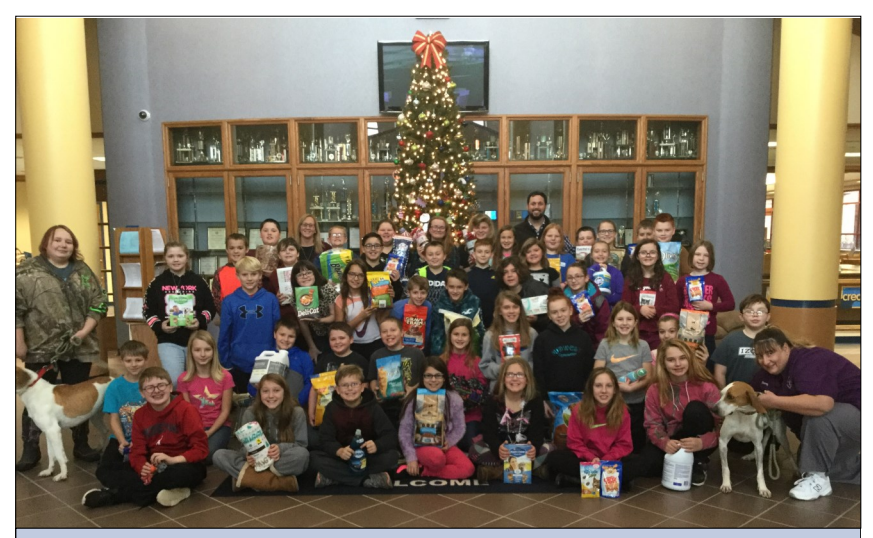
North Vermillion Elementary students collected food and toys for the Parke Vermillion County Humane Shelter.