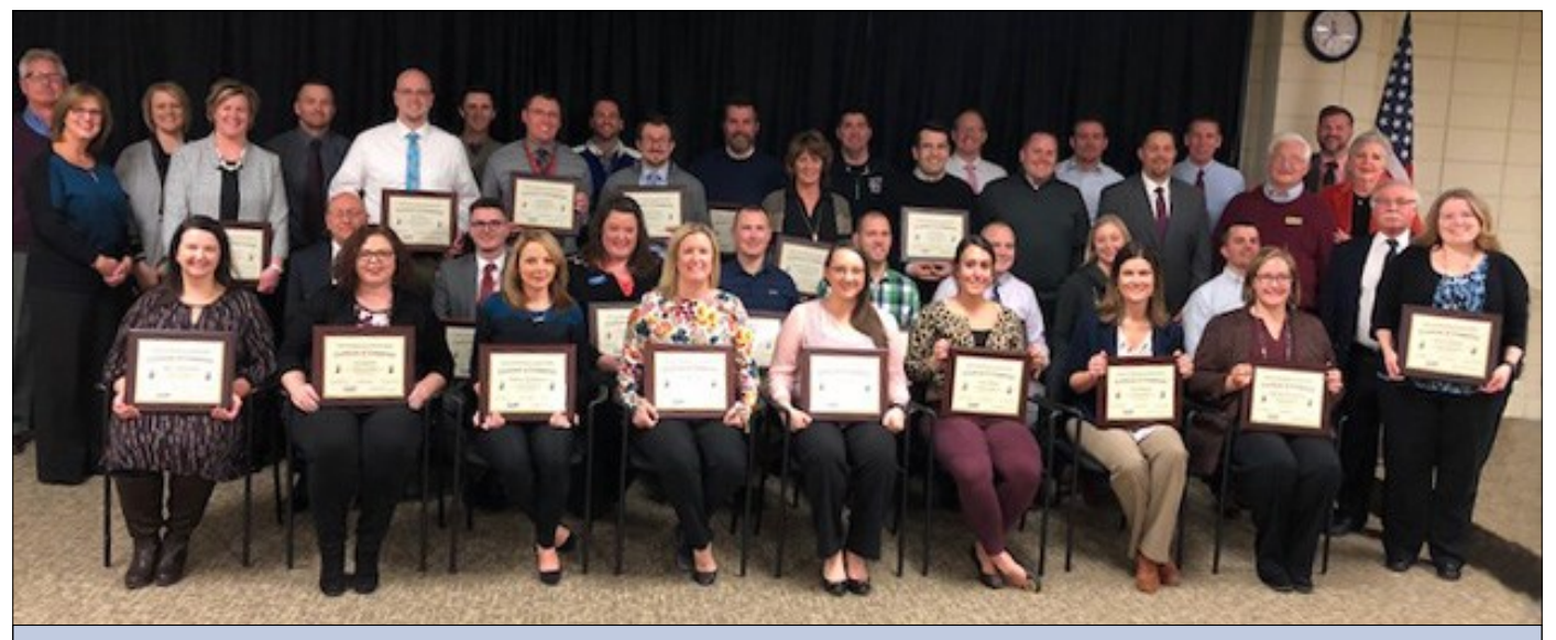
The Indiana New Administrators Leadership Institute (INALI) graduated 70 new school administrators on February 5, 2018, as part of Cohort 3.