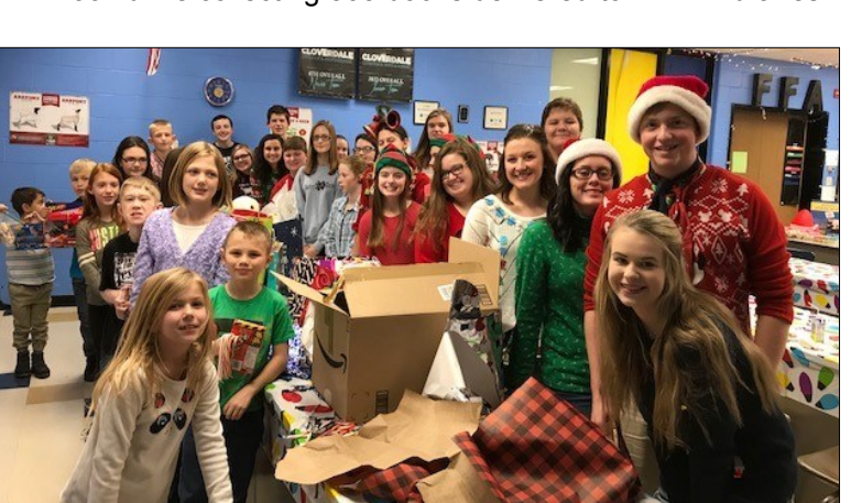
FFA students at North Putnam High School paired up with elementary students and participated in Secret Santa.