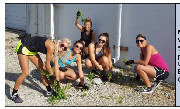
Members of the Western High School senior class pull weeds during the annual "Give Back to the Community Day."