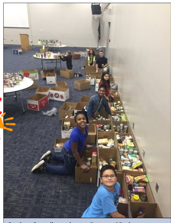
Student Council members at Raymond Park Intermediate Academy organizing collected food donations.