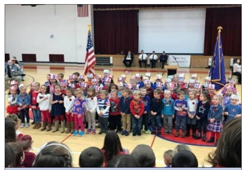
South Central Elementary School hosted a Veteran's Day Program.